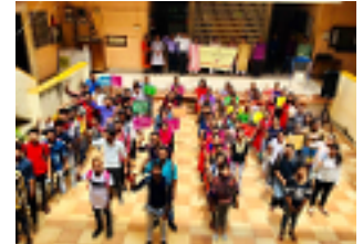
World No Tobacco Day