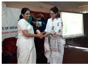
AIDS Awareness Program